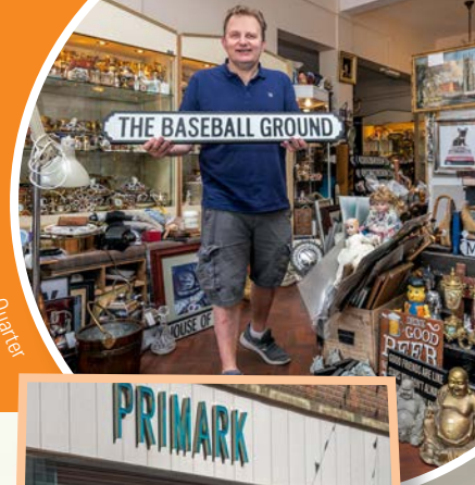
Antiques in the Quarter

Historic Sadler Gate features a number of fashion boutiques and gift shops. Connecting Sadler Gate to The Strand is the 19th century Strand Arcade, home to a diverse range of specialist shops, whilst The Strand itself, is a wonderful crescent of Victorian buildings housing a number of well-established independent retailers.